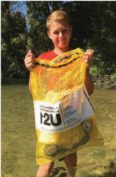
A youth volunteer assists with trash cleanup on a Texas river.

In partnership with landowners, angling clubs, paddlers, and local community organizations, a litany of local stewardship projects have now been completed at the leased properties and adjacent reaches of river. Examples include removal of more than 100 tons of trash from one access area that previously served as an illegal dumping ground, improvements to parking areas and kayak launch areas, installation of kiosks that promote river stewardship, control of soil erosion and river sedimentation through reseeding and planting of native vegetation, control of invasive riparian plants, and installation of fencing and gated entries to control or direct public access or prohibit livestock from the public river access areas.