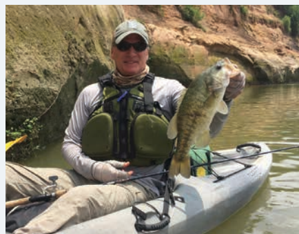
Guadalupe Bass, the official state fish of Texas, caught while fishing the lower Colorado River near the City of Smithville

Through these public-private partnerships, public river access has been enhanced on more than 170 miles of Texas rivers, resulting in substantial economic benefits to local communities. Using 2015 angler counts and recently published data on river fishing trip expenditures, we calculated lease-specific returns on investment ranging from 10:1 and 19:1 at three river access leases on the Guadalupe River. The estimated economic benefit to local communities from improved access at the three leases in 2015 was $380,081. By extrapolating these economic benefits across the network of leases supported through the River Access and Conservation Areas program, we estimate that the program is currently generating upwards of $2.4 million in annual economic value to local communities.