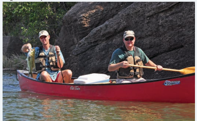
Anglers fish by canoe on the Brazos River.

As evidenced by responses in the Hill Country river fishing study referenced above, non-motorized watercraft such as