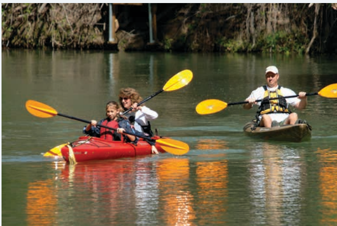
A family kayaks the San Marcos River at the Luling Paddling Trail.

To enhance river access opportunities and encourage fishing, wildlife-viewing, and other forms of nature-oriented recreation on Texas rivers, the Texas Parks and Wildlife Department established the Texas Paddling Trails Network, which currently consists of 73 trails that encompass 592 miles of Texas rivers. The Texas Paddling Trails Network designation promotes existing public river access areas that offer safe and reliable