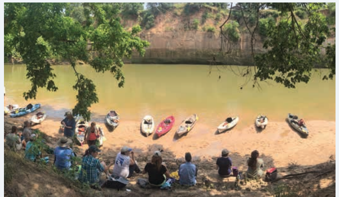
Public river access lease at Hidden Shores on the Colorado River upstream of the City of Smithville

Through these public-private partnerships, public river access has been enhanced on more than 170 miles of Texas rivers, resulting in substantial economic benefits to local communities. Using 2015 angler counts and recently published data on river fishing trip expenditures, we calculated lease-specific returns on investment ranging from 10:1 and 19:1 at three river access leases on the Guadalupe River. The estimated economic benefit to local communities from improved access at the three leases in 2015 was $380,081. By extrapolating these economic benefits across the network of leases supported through the River Access and Conservation Areas program, we estimate that the program is currently generating upwards of $2.4 million in annual economic value to local communities.