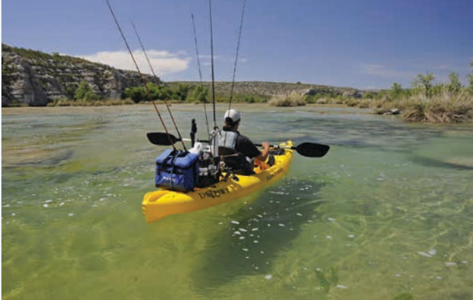
Devils River near Del Rio, TX