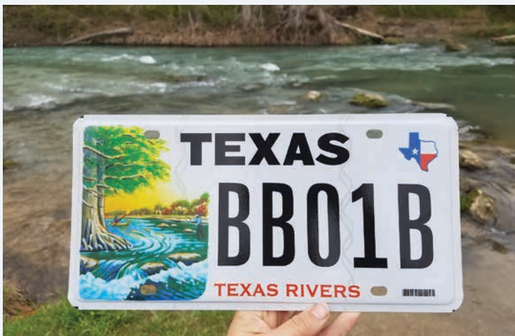
The recently launched Texas Rivers Conservation License Plate