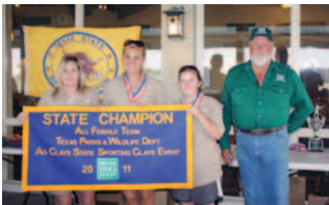
State Champion All Female Sporting Clays Team – Devine