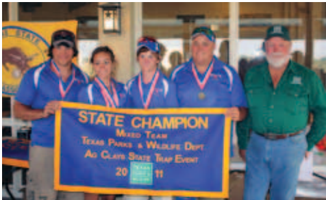
State Champion Mixed Trap Team – Brazoswood