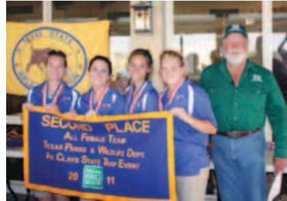
2nd Place All Female Trap Team – Brazoswood