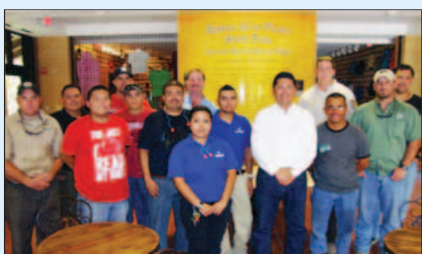
Resaca de la Palma State Park in Brownsville also held an Instructor course.