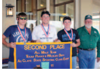
2nd Place All Male Sporting Clays Team – Bandera