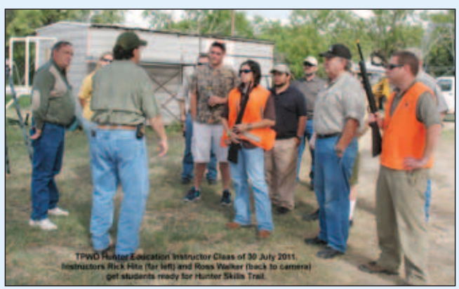
Shown here is the group going through the skills trail training during the Instructor course.