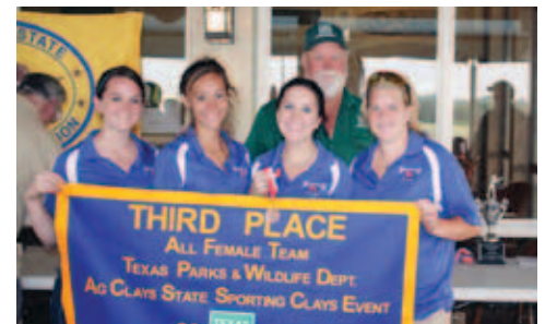
3rd Place All Female Sporting Clays Team – Brazoswood