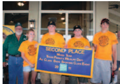
2nd Place Mixed Sporting Clays Team – Buffalo