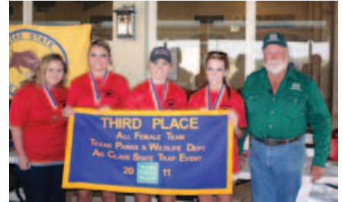
3rd Place All Female Trap Team – Whitharral