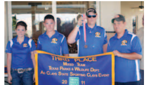
3rd Place Mixed Sporting Clays Team – Barbers Hill