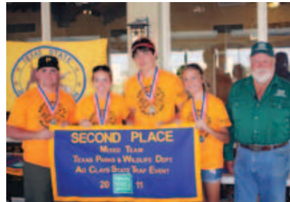
2nd Place Mixed Trap Team – Buffalo