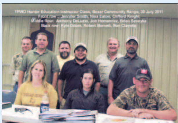
Area Chief instructors in San Antonio hosted an Instructor course.