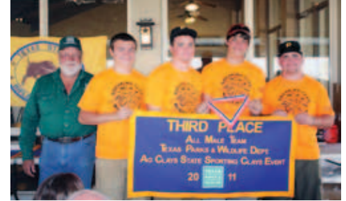
3rd Place all Male Sporting Clays Team – Buffalo