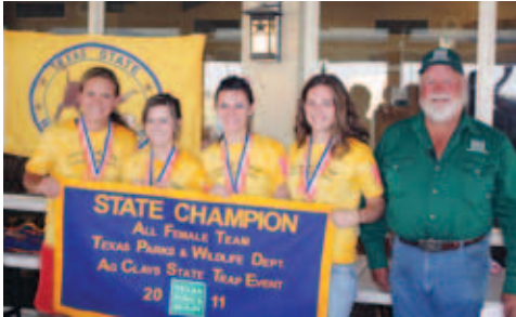
State Champion All Female Trap Team – New Diana