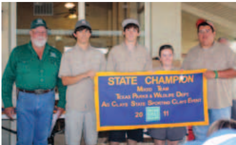
State Champion Mixed Sporting Clays Team – Devine