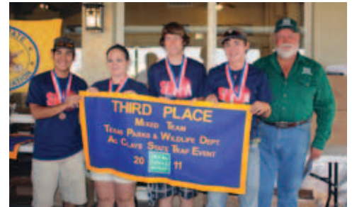
3rd Place Mixed Trap Team – Smithson Valley