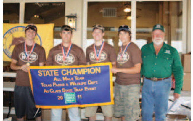
State Champion All Male Trap Team – Petrolia Not pictured: 2nd Place All Male Trap Team – Windthorst and 3rd Place All Male Trap Team – Whitharral

Congratulations to this year's top competitors!