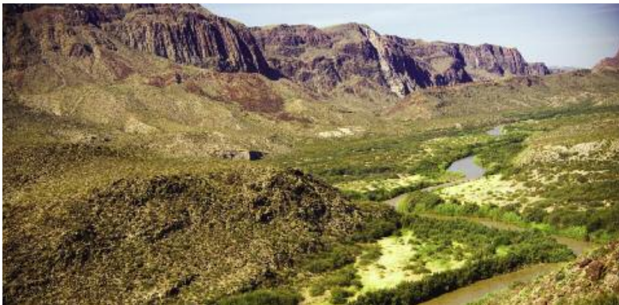
Rio Grande vista from pullout just west of La Cuesta (Big Hill).

El Camino del Rio, also known as The River Road or FM-170, skirts the southern boundary of Big Bend Ranch State Park. It has been touted by National Geographic as one of the most scenic highways in all of North America. And for good reason—traversing this road is like traveling through time. While hugging the banks of the picturesque Rio Grande, travelers are treated to windshield views of geologic formations that resulted from the region's tumultuous past, when volcanism shaped the landscape. The forces of faulting and erosion have sculpted the land over the millennia into the stunning vistas seen today. A kaleidoscope of natural wonders awaits you on this world-class drive.