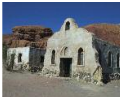
Contrabando movie set, located six miles west of Barton Warnock Environmental Education Center on the River Road.

For those wishing to leave the pavement, the River Road has several trailheads leading to more than 60 miles of backcountry trails that traverse some of the most remote areas in the Big Bend. The Rancherías Loop Trail is a favorite among backpackers. For day hikers, the Rancherías Canyon Trail leads to a waterfall that cascades over several rock ledges into a refreshing pool of water. The multi-use Contrabando Trail offers access to hiking, horseback riding and mountain biking. Interpreted sites along the way include a candelilla wax camp, ruins of an historic homestead dating to the late 1800s, and relics from the