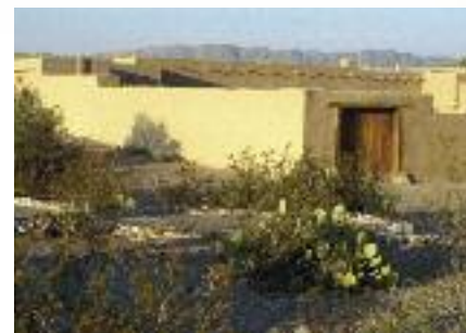
Pick up a map and enjoy the shaded picnic facilities at Fort Leaton SHS.

From several access points along the River Road, visitors can easily access the Rio Grande for fishing, floating, birding or simply to soak up the serenity and splendor or the river corridor. Three campgrounds provide picnic tables and shaded shelters for day use or overnight camping. Two designated group camping areas can support large groups.