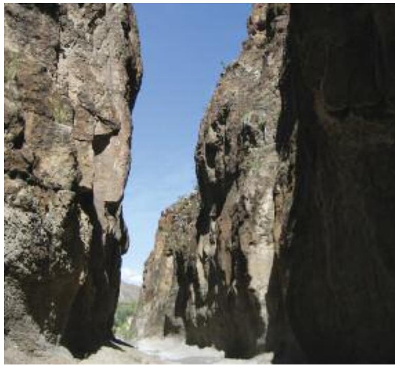
Hikers on the Closed Canyon Trail walk through a slice of geologic history.

The Closed Canyon Trail constitutes perhaps the most popular hike along the River Road corridor at Big Bend Ranch. The trailhead is located approximately 29 miles east of Presidio and 36 miles west of Study Butte on FM-170 (The River Road) between La Cuesta (The Big Hill) and the Colorado Canyon River Access. This relatively easy three-mile round-trip trail enters a slot canyon that portrays the incredible sculpting power of water and erosion. Deep inside the canyon, hikers can stretch out their arms and touch both canyon walls simultaneously while looking up at the canyon rim 150 feet above. Imagine the force required to slice through solid rock in this way!