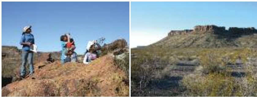
A group of middle and high school students meander through low hills, ocotillo forests and along ancient streambeds on the Encino Loop Trail.

The Encino Loop Trail, located in the interior of Big Bend Ranch State Park, follows an old jeep trail nearly nine miles through a remote portion of the Encino Pasture. This wide, easy-to-follow trail offers opportunities for hiking and mountain biking, birding and photography. An easy hike and a moderately strenuous mountain biking experience, the trail offers great views of ancient lava domes, rugged mesas and colorful desert vegetation.