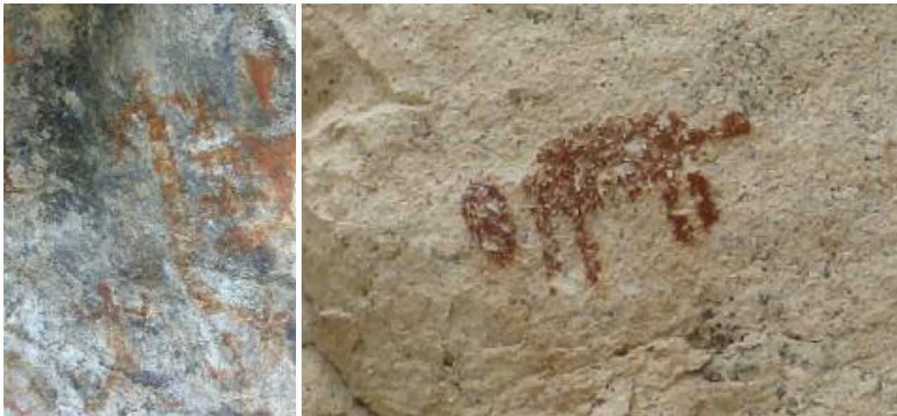
Ancient Native American pictographs in Big Bend Ranch State Park. Please treat these sites with the sensitivity that they deserve. Please do not touch the pictographs or spray liquids on them, which may accelerate fading.

Though early Spanish explorers to the Big Bend referred to the region as el despoblado , meaning uninhabited or deserted, the region has in fact been continuously inhabited or visited by various cultural groups for over 10,000 years. Native Americans lived in the region for most of that time. Beginning with the arrival of shipwrecked Spaniard Alvaro Nuñez Cabeza de Vaca, his companion Estebanico and a band of pack traders in 1535, Spanish, Mexican, and Euro-American populations also settled and traveled across the Big Bend.