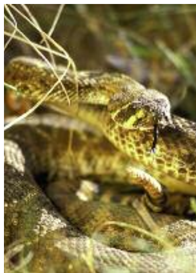
Western Diamondback rattlesnake

Watch where you put your hands and feet. Never harass or attempt to handle a rattlesnake—this is when most bites occur. Rattlesnakes are protected in the park; do them no harm.