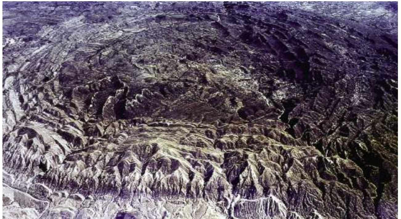
Aerial view of Solitario looking north-northeast. The lower outer rim's upside-down V's are the famous "Flatirons."

Please take a moment to peruse this issue of El Solitario and familiarize yourself with all the park has to offer. I truly believe that you will be as excited as I am about the future of Big Bend Ranch State Park.