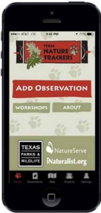
Use the Texas Nature Trackers smart phone app to provide your data to Texas citizen science projects