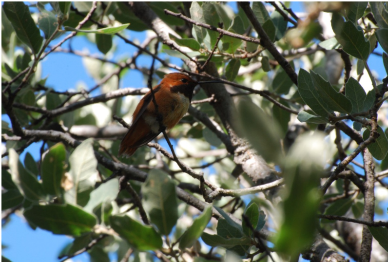
Rufous Hummingbirds often spend the winter in Texas