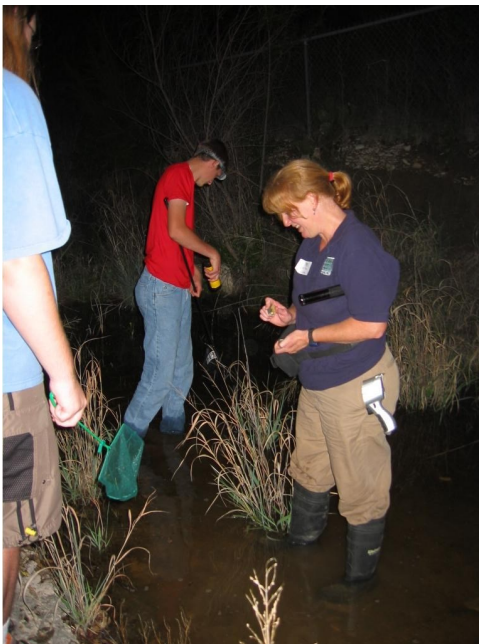
Texas Nature Trackers training