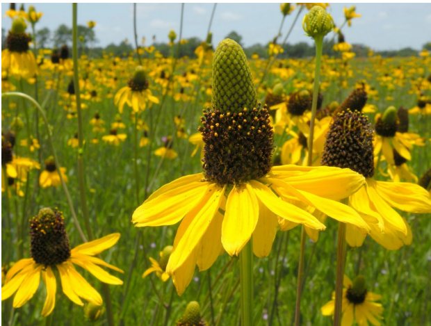
Texas coneflower

Subsequent visits to the extremely biodiverse Deer Park Prairie led to a growing list of no-longer-common prairie plants and grassland birds. Texas Parks and Wildlife Department botanist Jason Singhurst documented over 300 species of native plants. Efforts to save the prairie began soon after this discovery. Fortunately, the landowner was willing to sell and allowed access to the land for fundraising and field trips.