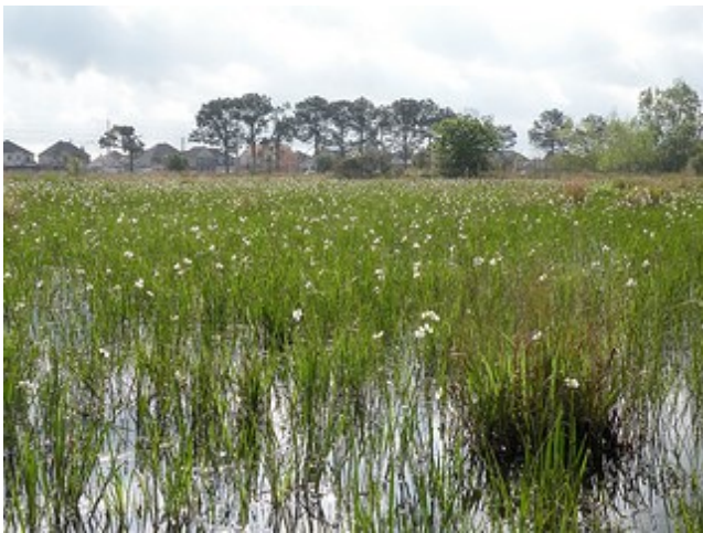
Wet season prairie

The prairie is now protected for the animals and plants that call it home. During winter months until well into May, meadowlarks, a