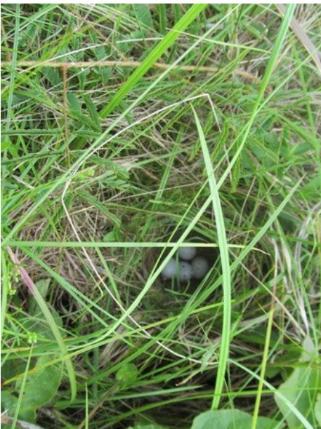
Meadowlark eggs in nest

Lan Shen is one of the many dedicated volunteers at Deer Park Prairie.