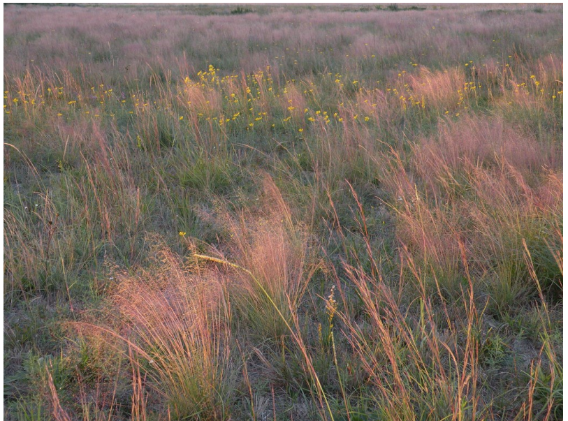
Gulf Muhly

Prairie had not been hayed or mowed for almost three years. Prairies are a disturbance ecosystem. In pre-settlement times, bison grazed and trampled an area then moved on, fires started by nature or by native Americans moved through and other disturbances combined to disturb the area. These renewed the prairie. They suppressed the growth of trees and woody shrubs such as eastern baccharis ( Baccharis halmifolia ) and wax myrtle ( Myrica cerifera ), and removed dead plant material from the previous growing seasons. (Most prairie plants are perennials whose tops die in winter and growth starts anew from the plant base in the spring.) Today, the best remnants are hay fields that are cut annually or biannually to remove the hay.