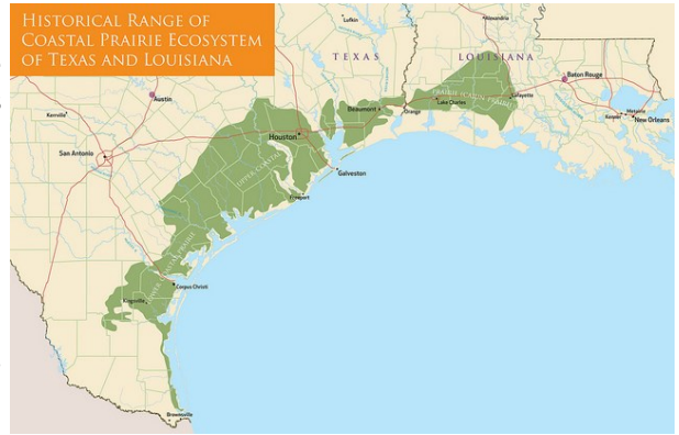
Historic expanse of the coastal prairies.

( Eryngium yuccifolium ) while driving the back roads in July leads to screeching brakes and a U-turn to check the field for other indicator plants such as the dominant native grasses of the coastal prairie: little bluestem ( Schizachyrium scoparium ) , brownseed paspalum ( Paspalum plicatulum ) or Indian grass ( Sorghastrum nutans ). In late summer, that brake-screeching plant may be lavender-pink blazing stars ( Liatris sp. ) or mists of pink Gulf muhly ( Muhlenbergia capillaris ). In fall, seeing stands of dominant native tallgrasses is a sure sign of a good prairie remnant.