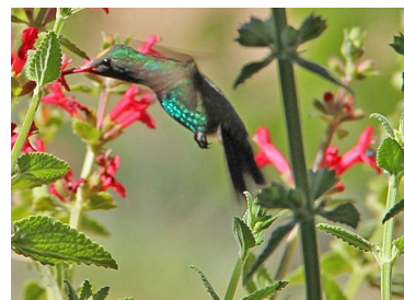
Broad-billed Hummingbird

Not in the DFW area? We still want your observations on iNaturalist.org or the Texas Nature Trackers smart phone app . Add them to the “Mammals of Texas” project.