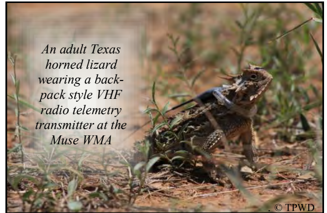
An adult Texas horned lizard wearing a backpack style VHF radio telemetry transmitter at the Muse WMA

As of May 2015, staff at the Muse WMA have begun daily tracking efforts of the lizards once again, and they are preparing to collect an additional 20 lizards for release on the area during June. Release enclosures have also been constructed at Mason Mountain Wildlife Management Area in Mason County, and 15 lizards will be released and tracked at that site beginning in June. The information learned from this study will help determine whether or not horned lizard populations could be restored into areas that possess good habitat. Due to the project's growth and success during 2014, TPWD has also welcomed a graduate student from Tarleton State University to the project. To learn more about the project, contact staff at the Muse or Mason Mountain WMAs or view the video found at: www.youtube.com/watch?v=-zeVBsJ1HRU