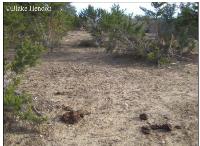
Poor soil and range health

The next time you walk outside, take a second to examine the ground under your feet and think about the very active community of microorganisms that live there. For instance, there are the saprophytic bacteria and fungi which are busy decomposing dead organic matter and releasing nutrients into the soil. Nitrogen fixing bacteria are hard at work converting nitrogen into a form usable by plants, and mycorrhizal fungi take up residence near plant roots helping the plants take up minerals and nutrients in exchange for carbon. Then there are the protozoa which eat bacteria and release excess nitrogen that can be used by other organisms. Protozoa also help to regulate bacteria populations by stimulating bacterial growth thereby increasing the rate of decomposition. Nematodes (non-segmented worms) feed on the bacteria, fungi, and protozoa; and in doing so release nutrients into the soil making them accessible to plants and accelerate the decomposition process. Nematodes also help to distribute bacteria and fungi throughout the soil. To put it simply, this community of organisms is cycling nutri-