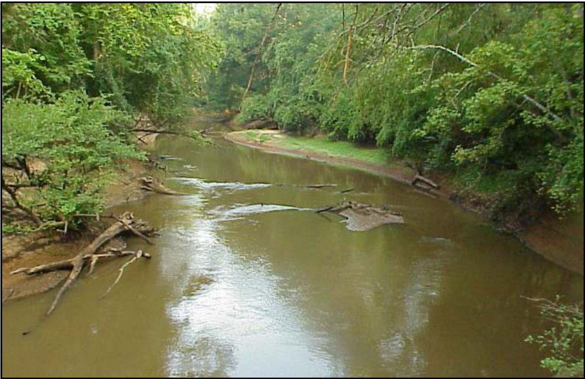
Figure 3. Angelina River north of SH 7 (8/14/01)