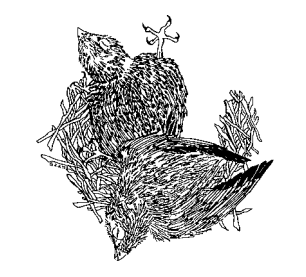
When ten days old, the tips of the swifts' flight feathers begin to unfurl