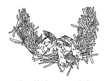
Five day old Chimney Swifts have pin feathers on their heads and bodies