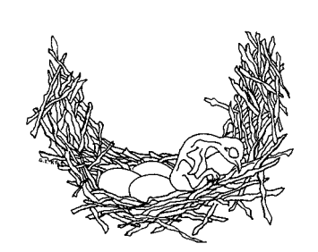
Newly hatched Chimney Swifts are naked and completely helpless

The female normally lays three to five white eggs in a nest of twigs which are broken from the tips of tree branches, glued together with saliva and attached to a vertical surface. Both sexes are involved in nest construction. The eggs are incubated by alternating adults for eighteen to nineteen days. Chimney Swifts catch flying insects on the wing. Baby Chimney Swifts are fed by both