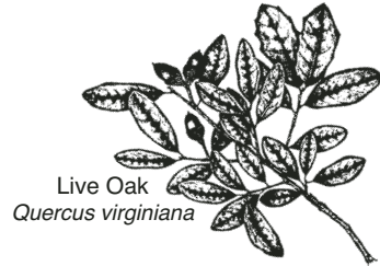
Live Oak Quercus virginiana