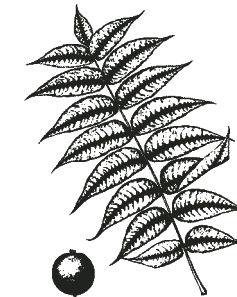
Black Walnut Juglans nigra