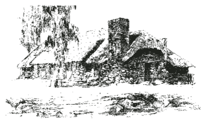
Civilian Conservation Corps (CCC) Refectory Many CCC structures still exist in the park. Please observe these with respect and admiration.

Flash Flooding Caution With no containment dam upstream, the river at this point is wild, untamed and subject to intense flash flooding. Be prepared to evacuate the park during advance notice.