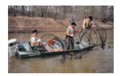
Flat Bottoms – Versatile and rugged.

Across the state TPWD has strategically located Marine Enforcement Storage facilities to house and maintain its fleet. Within a moment's notice TPWD can deploy any number of assets to any part of the state to respond to natural disasters, homeland security enforcement, or search and rescue operations.