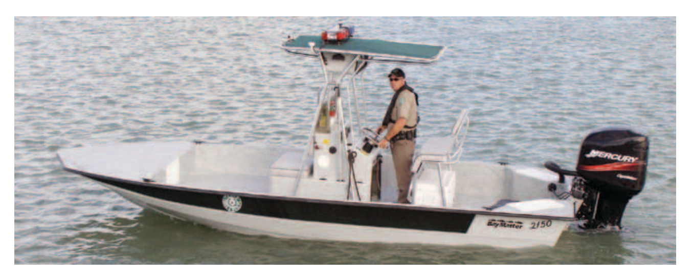
\pmb{V\text{-}\text{Hulls}} \text{ -} \text{ All-around performance and abilities, from lakes and rivers to the open gulf.}