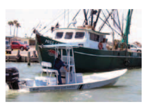
Total in fleet - 267