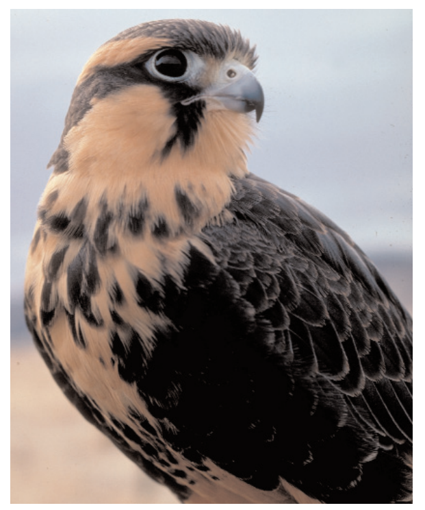
Aplomado Falcon

Distinguishing adult field marks include bold face markings; contrast-