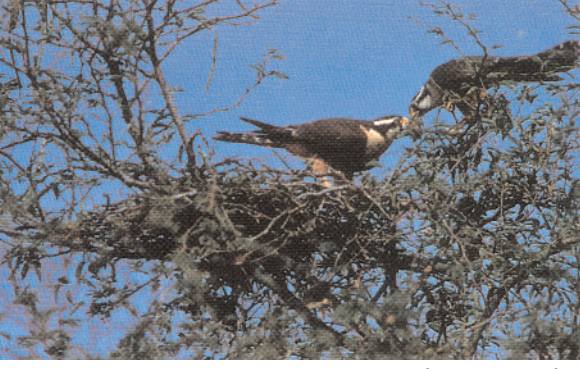
Male falcon providing food

may also nest in arboreal bromeliads or rarely on the ground. Egg laying usually occurs in March and April. Two to 3 eggs are laid and then cooperatively incubated for 31 to 32 days before hatching. Downy hatchlings are closely brooded by the female for the first week and less frequently thereafter. The male does the majority of the hunting for the nestlings, but may be joined by the female in this pursuit. Food items brought to the nest by the male are fed to the young by the female. Young leave the nest at 4 to 5 weeks of age and the adults continue to feed the fledglings away from the nest until their flight feathers are fully grown. Little is known about the dispersal or survival of young; although, one juvenile banded as a nestling in northern Chihuahua, Mexico, was observed approximately 180 miles away in southcentral New Mexico. In eastern Mexico, 25 nests produced 38 nestlings from an estimated 66 eggs. Similarly, in Chihuahua, Mexico, 7 nests produced 11 nestlings from 18 eggs.