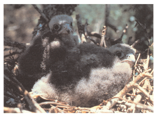
Aplomado Falcon chicks

There is no evidence that Aplomados build their own nest, instead the pair takes over an old or newly constructed stick nest of another raptor, large jay, or raven. Aplomados