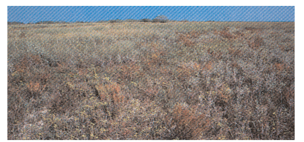
Aplomado Falcon habitat in South Texas