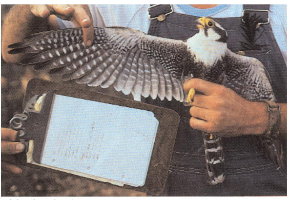
Adult Aplomado Falcon

monitoring efforts, and because of the remoteness and inaccessibility of the bird's habitat. In Chihuahua, Mexico, home ranges for 10 individuals ranged from 1.3 to 8.1 square miles. Causes of mortality in wild adults are not well understood. However, Brown Jays are suspected nest predators in eastern Mexico, and the Harris's Hawk and Great Horned Owl have been known to prey on released, captive-reared fledglings in southern Texas.