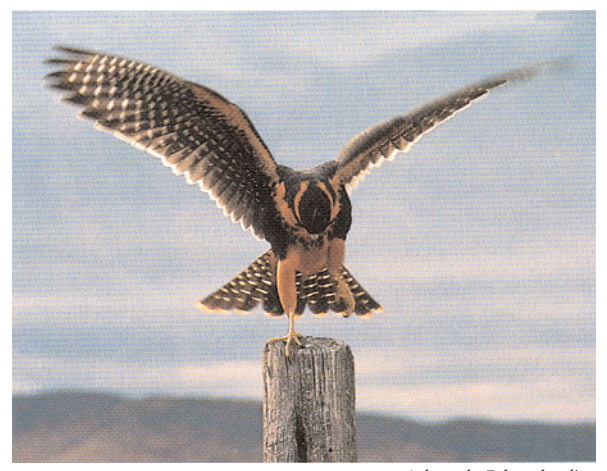
Aplomado Falcon landing

Reintroduction of captive-reared Aplomados into the historic U.S. range was considered an essential step in the 1990 federal recovery plan. As early as 1977, the Chihuahuan Desert Institute at Alpine, Texas had begun a captive breeding program based on wild- captured Aplomado breeding stock from south-