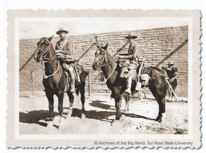
Although Fort Leaton was not a military fort, the U.S. Army maintained an intermittent presence. As shown here, members of the U.S. Cavalry visited the site in 1916.

A handful of journal entries provide a glimpse of life at Fort Leaton in its early days. In 1848, 70 men led by John Coffee Hays traveled from San Antonio to the Big Bend area on a mapping expedition. Today that trip would take about seven hours, but in 1848 it took two months! Imagine how welcome the relative safety and comfort of Fort Leaton must have seemed after such an arduous journey. The expedition purchased horses, mules and other supplies at the fort.