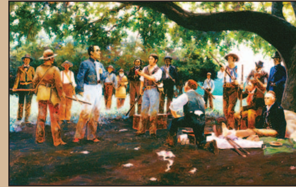
SAN JACINTO MUSEUM OF HISTORY

ON THIS STRIP OF COASTAL PRAIRIE IN 1836, A VOLUNTEER ARMY OF ANGLO-AMERICAN SETTLERS AND TEJANOS DECISIVELY DEFEATED A LARGER MEXICAN ARMY AND WON TEXAS' INDEPENDENCE. THIS 1,200-ACRE HISTORIC SITE AND MONUMENT COMMEMORATE THEIR STRUGGLE AND ACHIEVEMENT.