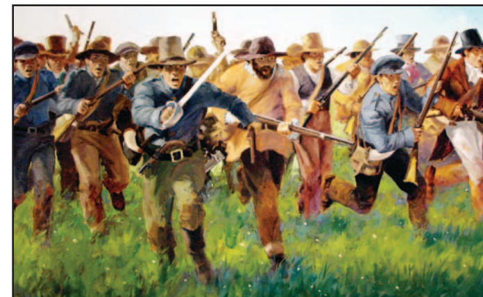
Illustration titled Sherman's Men Attack by Charles Shaw.

In the confusing skirmish the Mexican army was unable to implement its battle plan. The fight was over in less than 20 minutes. The Texans killed over 600 Mexican troops and captured most of the rest. Nine Texans died in the battle. General Santa Anna was captured the next day and forced to sign a treaty that recognized Texas' independence and opened the gateways for America's continuing westward expansion.