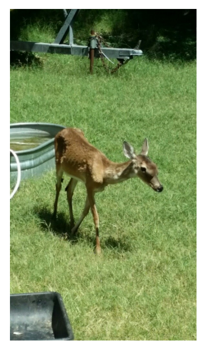
White-tailed deer sickened from parasites.

It was a hot July day when I received the first phone call from a resident in Comal County, "I have a dead deer in my yard and there are other deer that look skinny and sick". That was the first of several phone calls I would receive over the next few weeks. All were residents describing deer "skinny" and "sick looking". Many residents expressed concern explaining they never observed so many sicklooking deer.