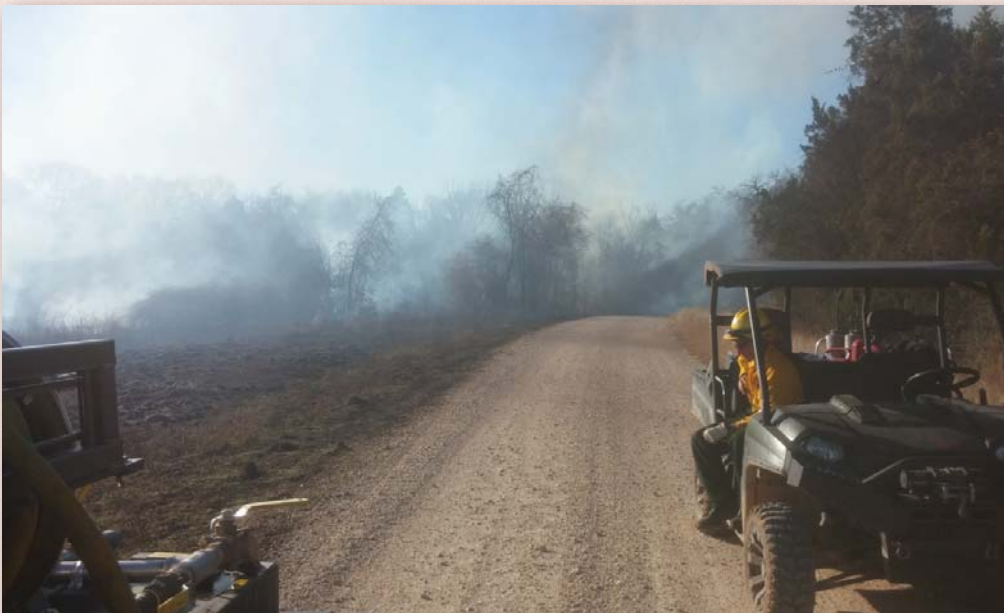
TPWD and Texas Forest Service employees conduct prescribe burning operations to achieve habitat management objectives for the Houston Toad and to reduce combustible fuels that could produce a wildfire.

Thankfully, we have made wonderful progress in our understanding of the value of conservation and we are realizing that we have the tools to do things right. As Aldo Leopold stated in his book, Game Management (1933), our tools consist of the ax, cow, plow, gun, and of course the most misunderstood and overlooked... Fire. The progressive fear of fire through the eras has been associated with extensive economic loss; however, times are once again changing and we are beginning to see that fire can improve the quality of the landscape for an economically valuable cost. The reintroduction of fire into an ecosystem can effectively manage the encroachment of brush while stimulating the production of our native grasses and forbs. The implementation of fire within a forested system can allow for the effective management of the understory brush buildup and allow the sunlight to reach the forest floor. All of these introductions allow for the recycling of minerals and nutrients back into the soil for continual use in the years to come, while dramatically improving and increasing the plant and wildlife diversity and their associated habitats. Additionally, periodic burning removes old dead fuels that can build up over time. This decreases the chances of catastrophic fires and mitigates the negative impacts when we do experience a wildfire.