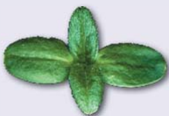
Sprouts and bloom petals are edible by humans. Winter and early spring are the perfect time to plant seeds.