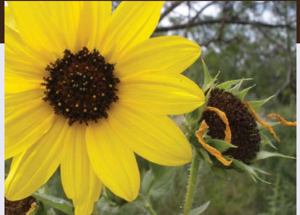
Flowers range from 2 to 5 inches across and follow the sun throughout the day.

Wild cousins of this early domesticated stock are still found along roadsides and in fields throughout North America. It is the most abundant wildflower in Texas probably because they thrive in full sun and require very little water. The bloom of this species faces east as the morning sun rises and follows the sun through the sky until sunset with its face turned towards the west. The name common sunflower in Spanish means “looks at the sun.” In Greek, the scientific name Helianthus comes from “helios” which means sun and “anthos” meaning flower thus the name sunflower. The common sunflower is an annual that begins blooming the end of May continuing through the fall. It is an allelopathic species that produces a chemical that reduces competition from other plants. Common sunflowers can grow from 2 to 8 feet tall with numerous branches that have flowers ranging from 2 to 5 inches across. The seeds are eagerly eaten by doves, quail, turkey, and various songbirds. It is a favored seed of the American goldfinch. Pollinators rely on common sunflower as a dependable nectar source during the hottest part of the summer. Winter and early spring are the perfect time to plant seeds so that you can experience the uplifting site of the bright blooms during hot summer months. I know the birds enjoy their fall bounty of delicious seeds.